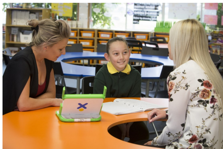
Learning Conversations @ GEPS