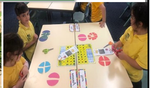
Halves, quarters and eighths.

Literacy - planning stories of learning on post it notes