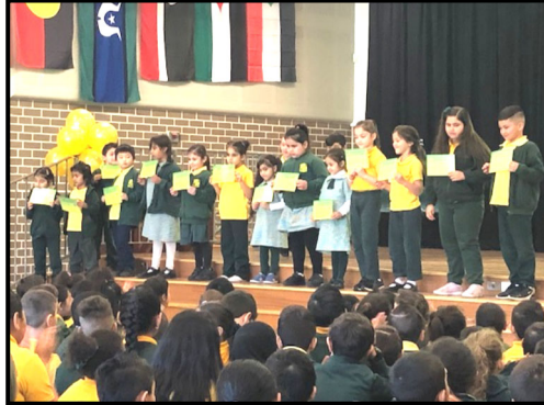
Some proud award winners

Open Day last week, was an opportunity to showcase the wonderful talent and opportunities here at GEPS. Thank you to those families who came to find out about us; visit classrooms; and to enrol your children for next year! Thank you too to the 4 fabulous Stage 2 students who spoke with parents and led the tour with me.