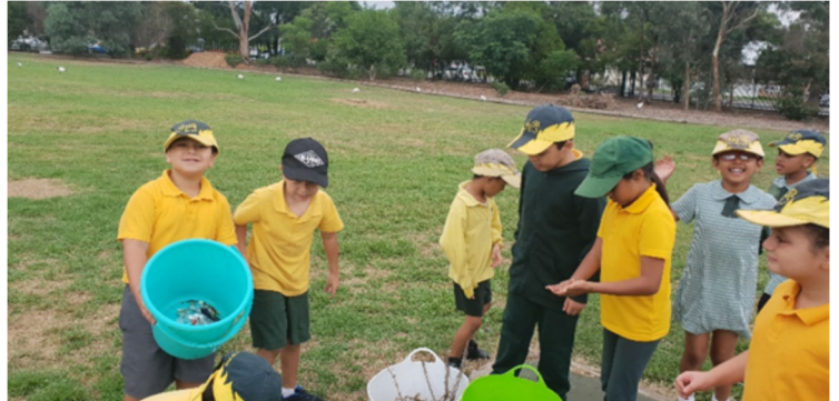
Picking up rubbish around the school.