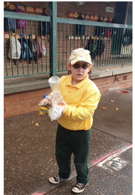
Planting seedlings in Western Sydney Parklands.

we have to care for our environment. If we don't our Earth will be filthy and not clean.