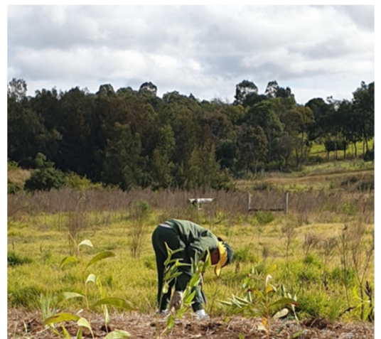
Writing about ways we can care for our environment.

We can take care of our environment by putting our rubbish in the bin. we can pick up rubbish so animals can't eat our rubbish. If they do they will choke and die. we could clean up our mess so kids can't trip. we can plant flowers or trees so some animals can live in the trees.