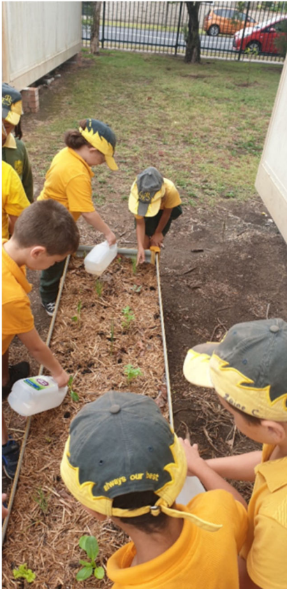
Planting seeds and watering the vegetable gardens.