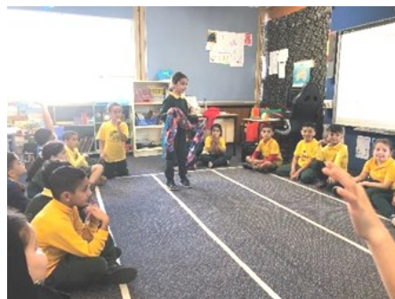
Creative thinkers in Year 2 use their imaginations.

Year 2 have been working with an artist from the Sydney Theatre Company! They are learning how drama can help bring literature to life. Each class has a special focus text: Voices in the Park by Anthony Browne (2A) and Herb the Vegetarian Dragon by Jules Bass & Debbie Harter (2W).