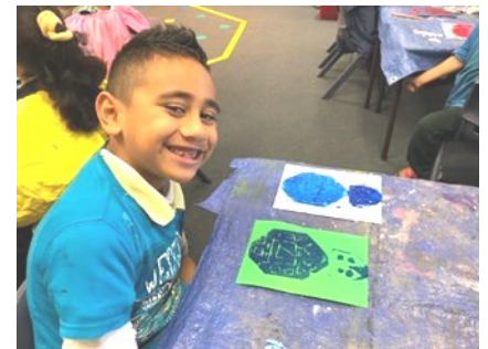
A Year 1 artist takes a break to smile at the camera