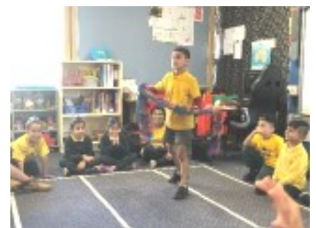
It's all about the acting!