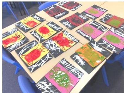
Year 1 artwork